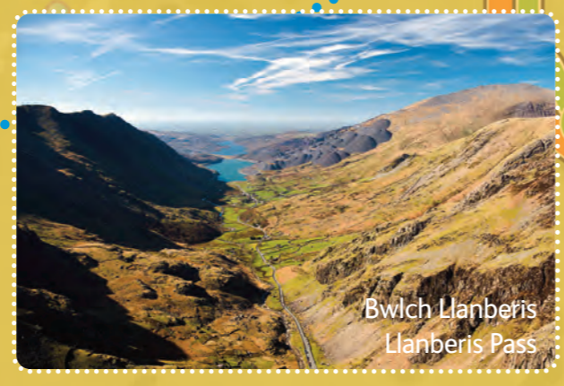
Bwlch Llanberis Llanberis Pass