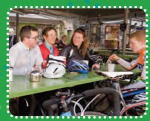
Betws y Coed

Wedi taith: Bwyta pryd llawn protein, â digon o garbohydradau i ailgyflenwi'r calorïau.