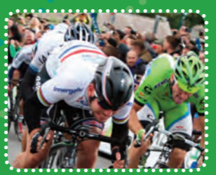
Tour of Britain