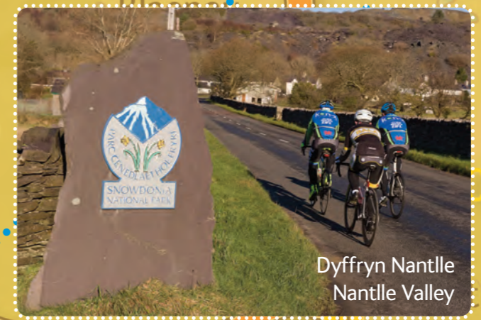
Dyffryn Nantlle Nantlle Valley